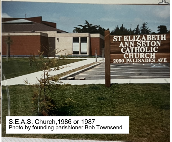
S.E.A.S. Church, 1986 or 1987