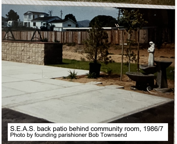
S.E.A.S. back patio behind community room, 1986/7