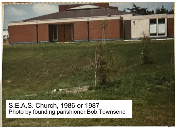
S.E.A.S. Church, 1986 or 1987