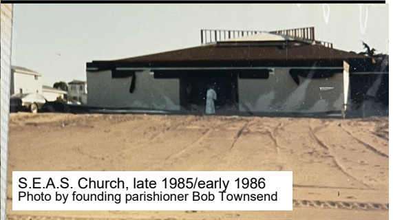
S.E.A.S. Church, late 1985/early 1986